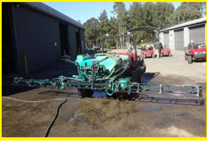
Before Pig Dog