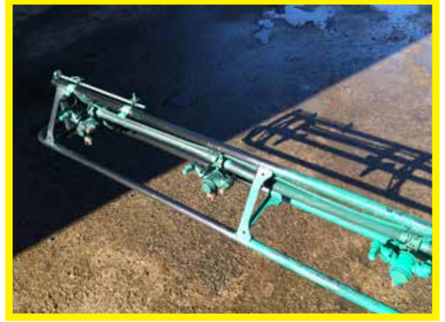
After 1 application Pig Dog