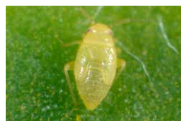
Apple Dimpling Bug