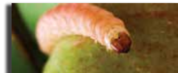
Codling Moth larvae