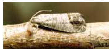
Codling Moth Adult