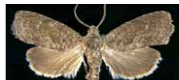
Oriental Fruit Moth